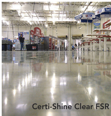
Certi-Shine Clear FSR